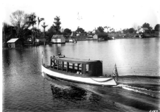
Indian Princess on Lake Santa Fe

Travel back in time on September 28th at 2:00 pm - when the Melrose Public Library will host a celebration to honor historic Melrose, Florida! "Melrose Back in the Day" will bring to life the